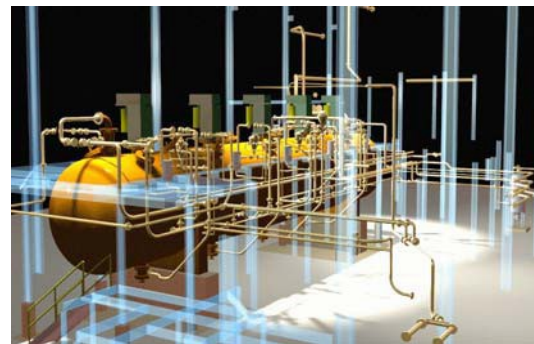
Figure 2 : Autoclave

Steady State Simulation: In steady-state mode IDEAS is used daily by operating companies to determine the optimum use of capital expenditure, and by engineering companies in process design. Autoclaves have been simulated (see Figure 2), by entering the steady state equilibrium equations as a function of pressure and temperature. Future enhancements to the aqueous solution solving capabilities within IDEAS will make this type of simulation even easier (see Section 4.0).